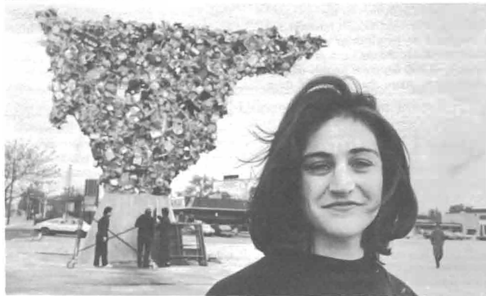
Nancy Rubins and her masterpiece.