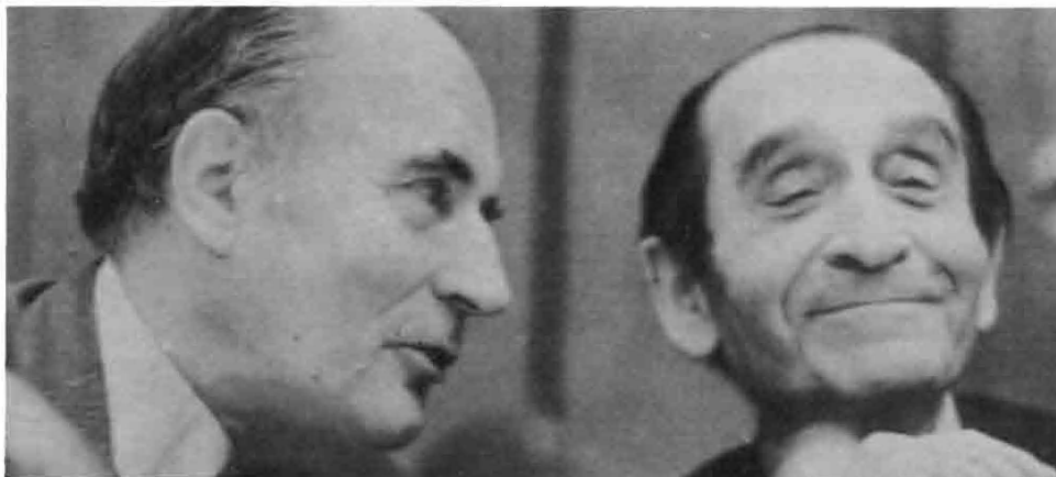
At his inauguration Mitterand told Mendès-France (right), "If I am president, it is thanks to you." The Jewish former Prime Minister, who surrendered the French colony of Indochina to the Vietnamese and thereby set the stage for the American military disaster in Southeast Asia, was thereupon, according to the jackals of the French press, "moved to tears."

Pete McCloskey, who picked up one delegate from New Mexico in 1972 as the Republican Party's antiwar alternative to Rich-