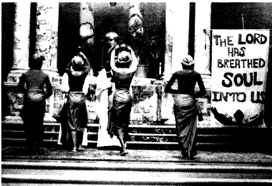
Praise the Lord

when a preacher-cum-aeronaut and his fifty followers failed to float heavenward like balloons, as he had so flatly predicted. Since some of those bound for glory had sold homes, businesses and cars in preparation for their flight departure, a little fast-talking was definitely in order on someone's part. Not missing a beat, the hot-air Christer said he "may" have had the date wrong, "but we know it's going to happen shortly."