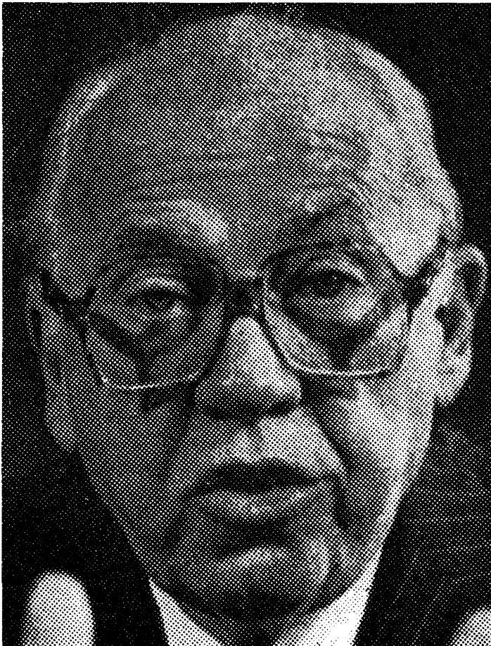
Casey's still at bat

For even thinking about appointing such a person, Casey should have been fired before Hugel. But he is hanging in there, despite his own less than pure Wall Street shenanigans and despite an "exclusive" Newsweek story that he was plotting the assassination of Libyan strongman Gaddafi. Anyway,