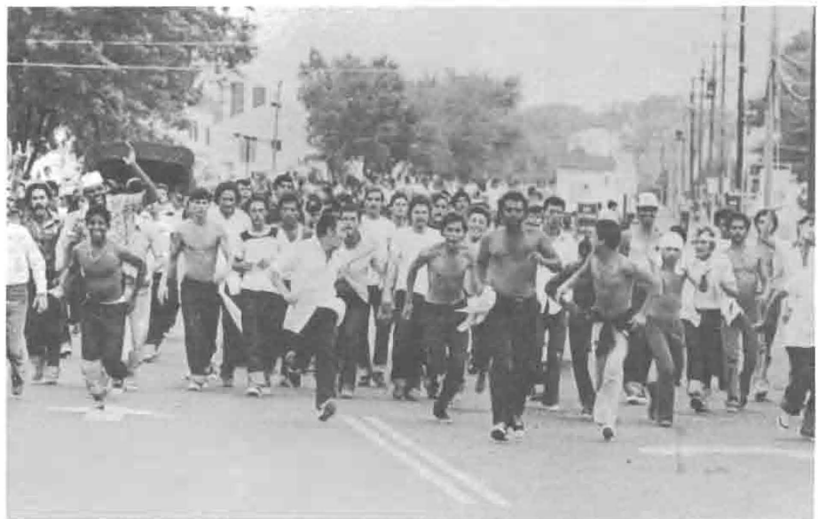
Cuban "refugees" running amuck in Fort Chaffee, Arkansas.