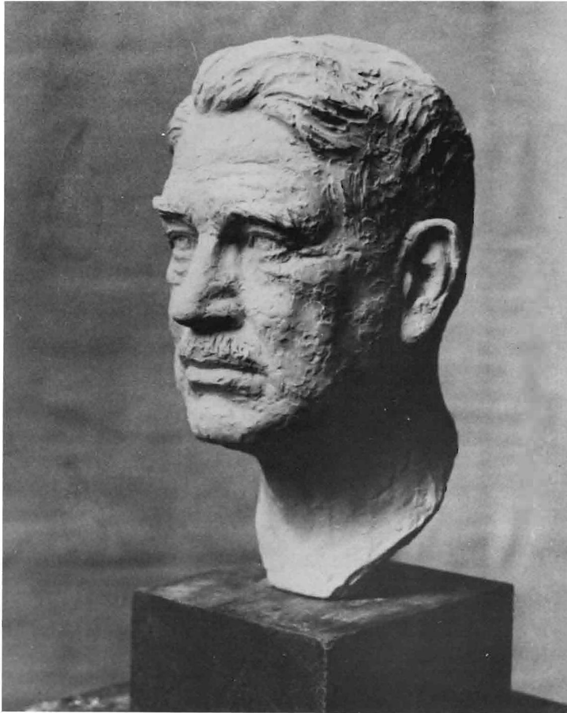
CARLETON STEVENS COON (1904-1981)